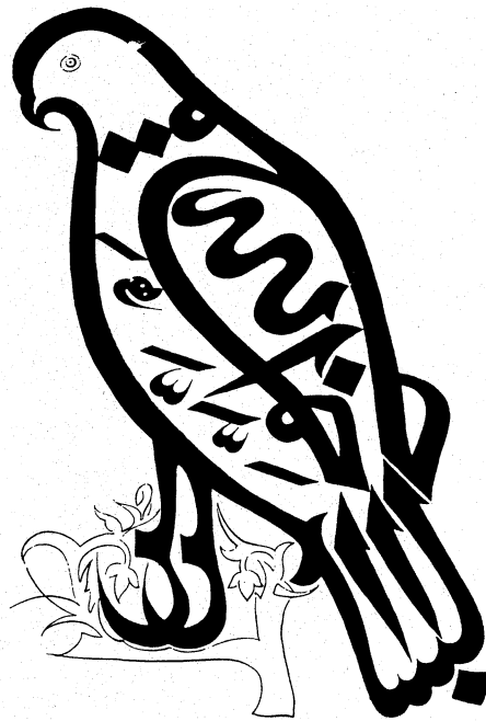
25 Bismillah written in Tughra in the shape of a falcon. Calligrapher and place of origin unknown